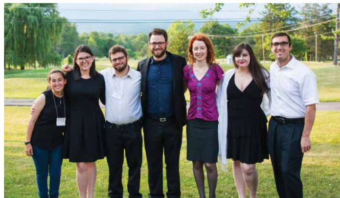
Training a New Generation of Musical Leaders – 2016 Choral Festival Fellows