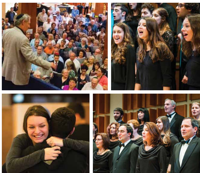
North American Jewish Choral Festival; Zamir Noded, HaZamir, Zamir Chorale.

This year has been a watershed for the Zamir Choral Foundation. We have expanded our reach, becoming an inter-generational, trans-denominational, and international movement. Through our many activities – HaZamir: The International Jewish High School Choir , Zamir Noded for young adults, the Zamir Chorale , the annual North American Jewish Choral Festival , and The Jeanne R. Mandell Fund for New Music , we are fulfilling our mission by connecting more Jews to our heritage, to our future, and, most importantly, to each other. We are grateful for the support of our generous donors who have enabled us to reach these new milestones.